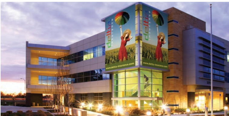
Outdoor communication - Banner

Anapurna M2500 has a fully separated white ink management system. (separate circulation system, under-pressure-regulation and cleaning circuit) The white ink tank is equipped with a stirring mechanism to keep the ink properly mixed at all times. And... pre- or post-white can be done in one production run.