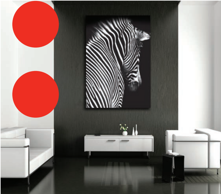
In-store communication - Dibond

Anapurna M2500 is a wide format high-speed UV curable inkjet system for graphic screen printers, photo shops and sign shops. It is a heavy-duty, turnkey and complete industrial UV inkjet system. It is designed to produce outdoor and indoor top quality wide format jobs in any 'print for pay' industry environment, on a wide range of rigid and roll-to-roll media. The white ink function creates new possibilities for printing on transparent material for backlit applications or printing white as a spot colour.