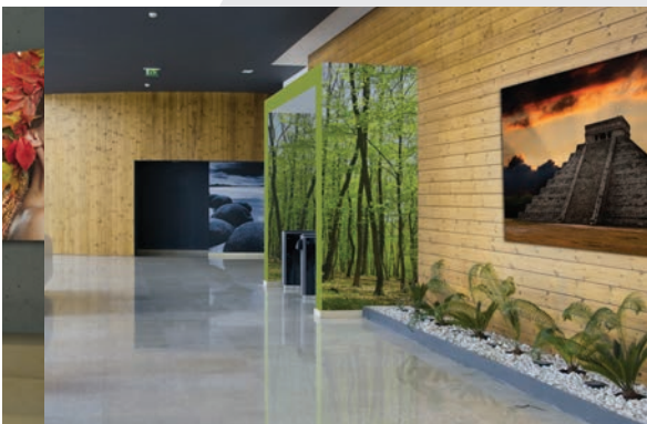
In-house decoration - Plexi glass - dibond

Switching between rigid and roll media is instant. Therefore Anapurna M2500 delivers exceptional print quality on a wide variety of indoor and outdoor media on uncoated rigid media, such as plexi glass, glass, mirrors, corrugated boards, rigid plastics, exhibition panels, stage graphics and advertising panels up to 4,5 cm thick, as well as roll media such as film, vinyl and paper, canvas and banners up to 4,5 cm thick.